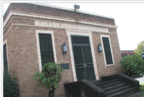
Fire Alarm Telegraph building in the Kerns neighborhood of Portland

Kerns is a neighborhood in the inner Northeast and Southeast sections of Portland, Oregon . It borders the Lloyd District and Sullivan's Gulch on the north, Laurelhurst on the east, Buckman and Sunnyside on the south, and (across the Willamette River ) Old Town Chinatown on the west.